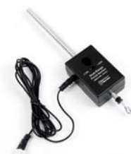
With hook for connecting to a string and measuring pulling force