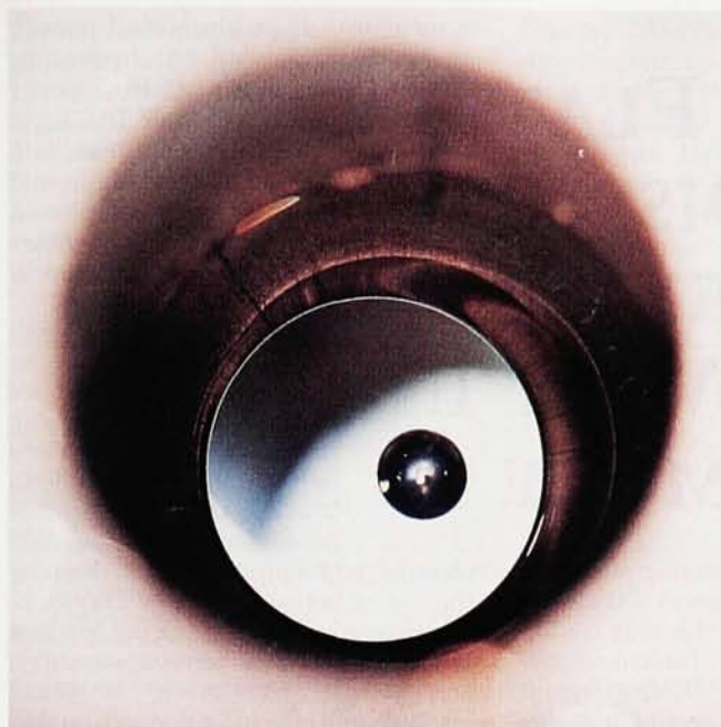
FIGURE 3: WEIGHTLESS FLUID DYNAMICS is one area in which research might exploit magnetic levitation, as exemplified by this hovering globule of water.

found an abnormal development of frog embryos in artificial microgravity, they probably rightly attributed it to the influence of weightlessness rather than to the magnetic field.