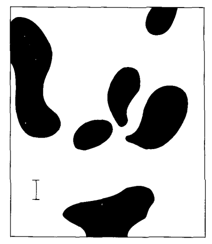
Figure 2. An example of a "dappled" pattern as resulting from a type (a) morphogen system. A marker of unit length is shown (see text, Sections 9 and 11).

The term in U^2 can be ignored if At^2 is fairly large, for then either B^2U^2/A^2 is small or the factor e^{-BUt} is. But At^2 certainly is large if the factor e^{At^2} , applying when U=0, is large. With this approximation the variance takes the form C e^{-1/2k^2U} , with only the two parameters C, k to distinguish the pattern populations. By choosing appropriate units of concentration and length these pattern populations may all be reduced to a standard one, e.g. with C=k=1. Random members of this population may be produced by considering any one of the type (a) systems to which the approximations used above apply. They are also produced, but with only a very small amplitude scale, if a homogeneous one-morphogen system undergoes random disturbances without diffusion for a period, and then diffusion without disturbance. This process is very convenient for computation, and can also be applied to two dimensions. Figure 2 shows such a pattern, obtained in a few hours by a manual computation.